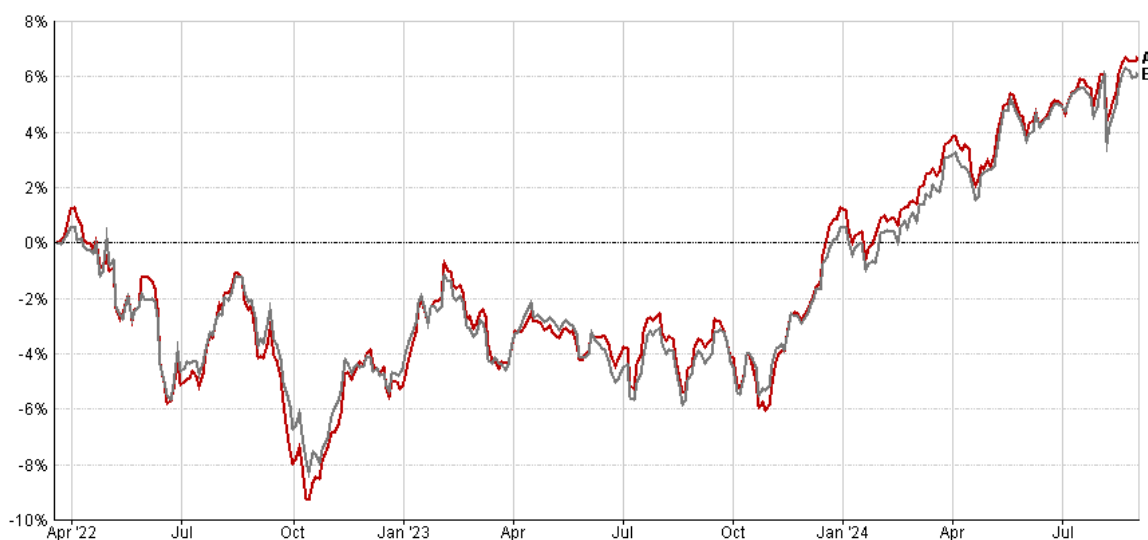
■ A - IA Mixed Investment 20-60% Shares TR in GB [6.73%] ■ B - Portfolio Management/MP3 (FP MW Passive Cautious from 21/03/2022) 21/03/2022 TR in GB [6.16%]

21/03/2022 - 30/08/2024 Data from FE fundinfo2024