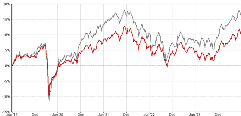
■ A - IA Mixed Investment 20-60% Shares TR in GB [16.41%] ■ B - FP - Mattioli Woods Cautious B TR in GB [10.32%]

31/05/2019 - 31/05/2024 Data from FE fundinfo 2024